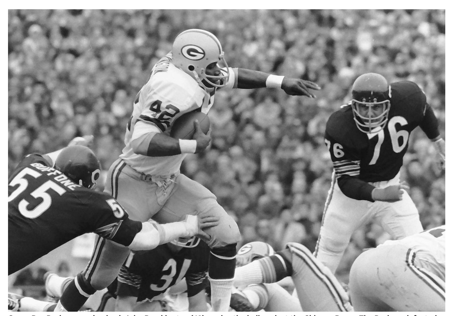
Green Bay Packers running back John Brockington (42) carries the ball against the Chicago Bears. The Packers defeated the Bears 23-17 on Nov. 12, 1972, at Soldier Field in Chicago.